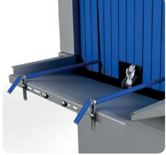
Plastic crate guides