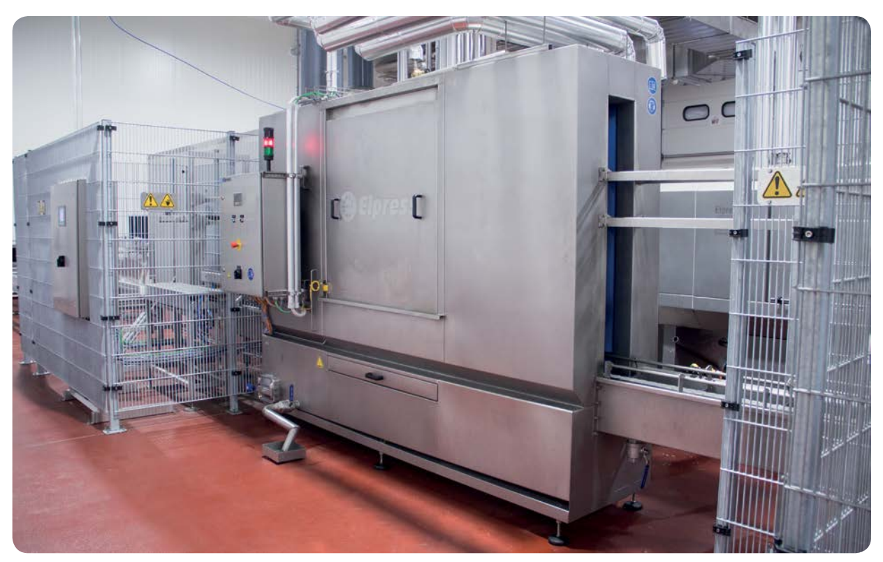
The EPW-45 with automated feed and removal.