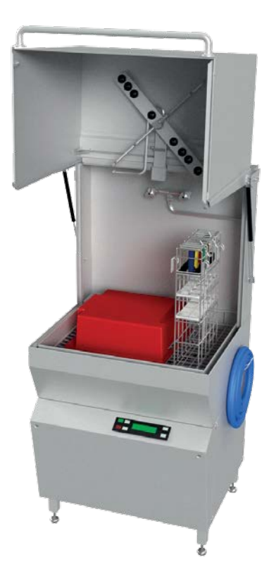
Wash volume ETW-10: 610 x 690 x 635 mm (hxwxd)