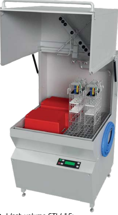
Wash volume ETW-15: 610 x 810 x 635 mm (hxwxd)