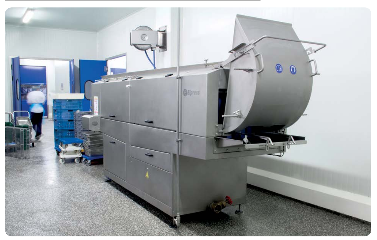
The EKW-3500, with optional one-person operation.