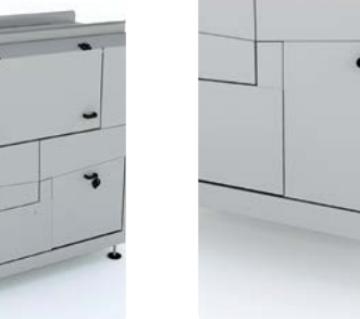
Increased crate height crates up to 400 mm