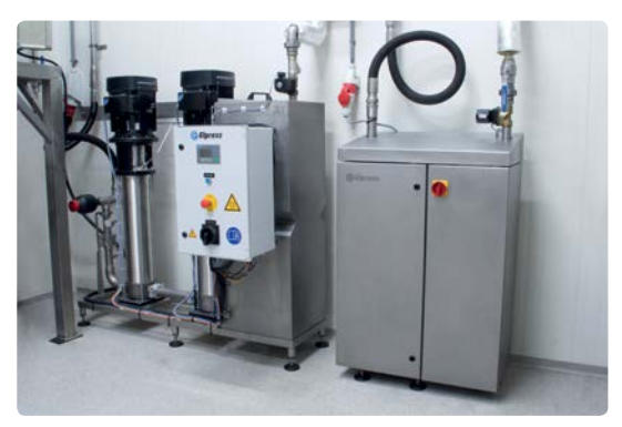
Cleaning systems Elpress cleaning systems have set the standard in the area of cleaning business and production areas since 1988.