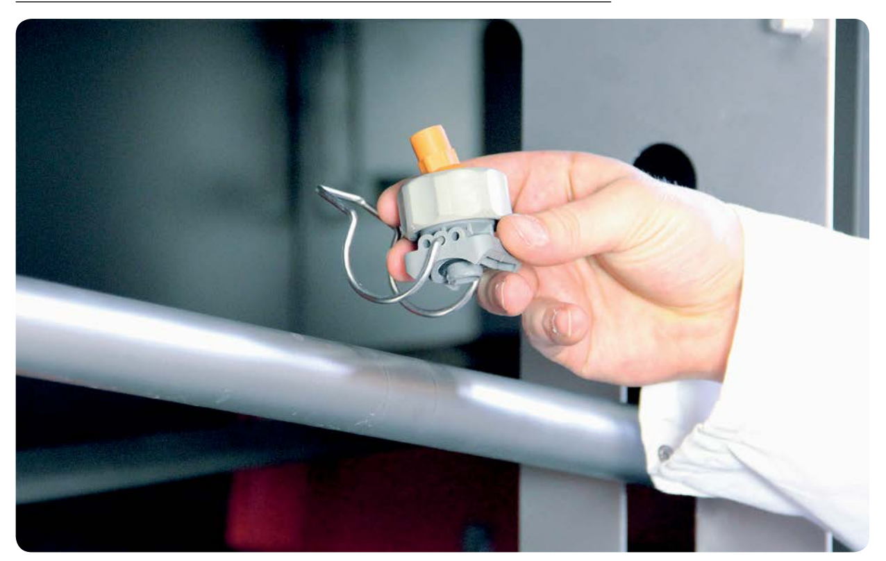
The EKW-5000, easy adjustment and replacement of nozzles.