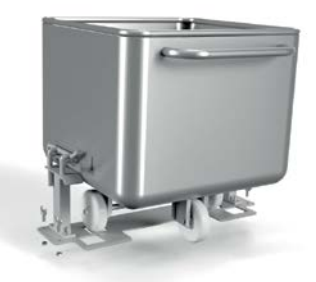
Norm bin frame for EDW-20