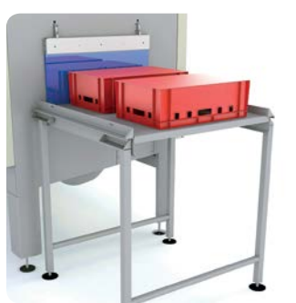
Infeed and outfeed conveyor