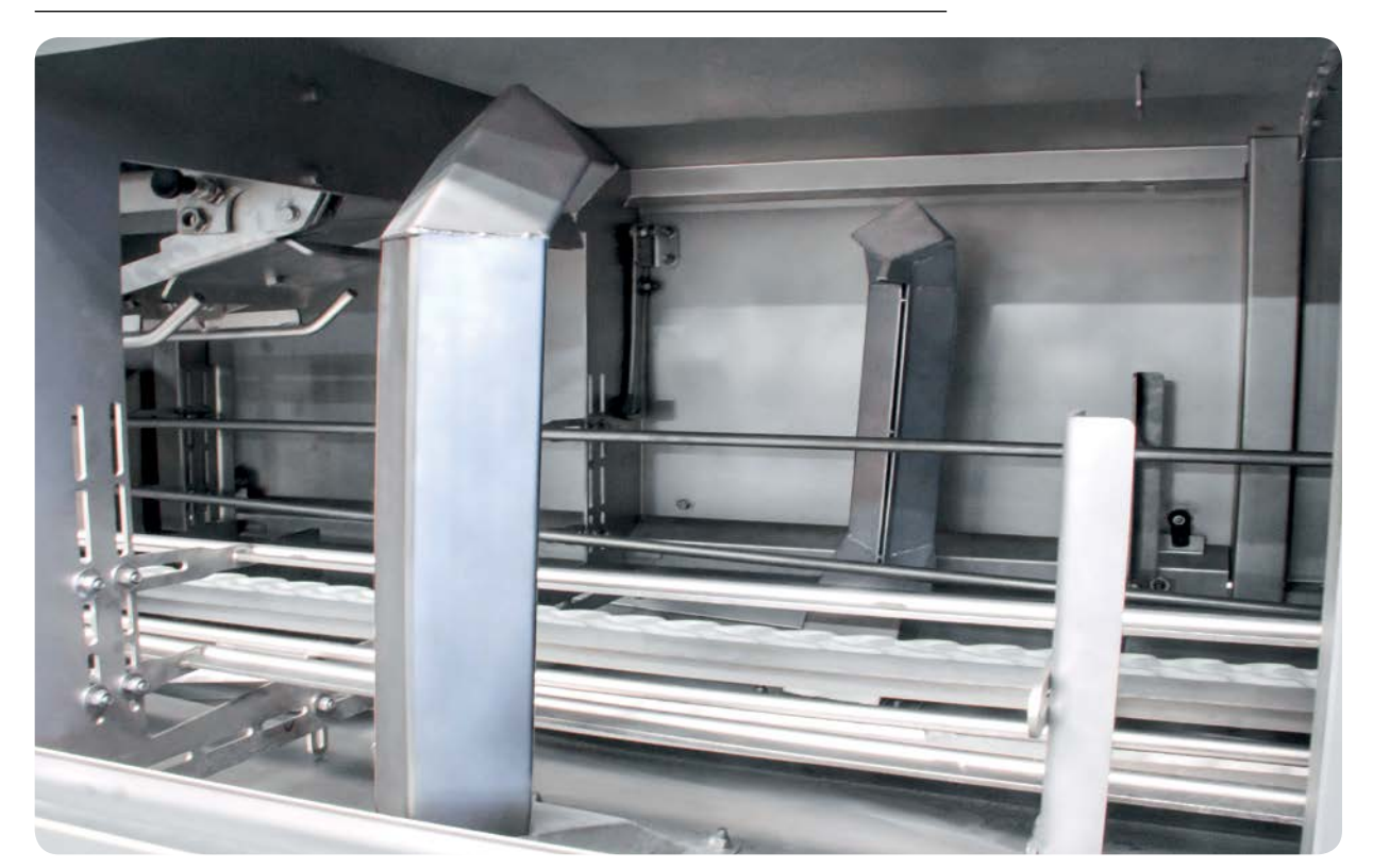
The inner workings of the EAB-1-ST, the air blades 'cut' the residual water from the crate.