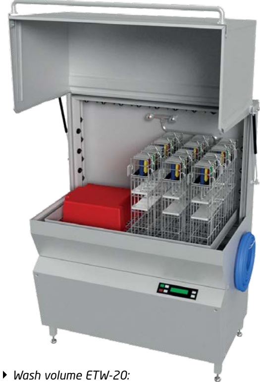
645 x 1010 x 635 mm (hxwxd)

Wash volume ETW-17: 640 x 810 x 635 mm (hxwxd)