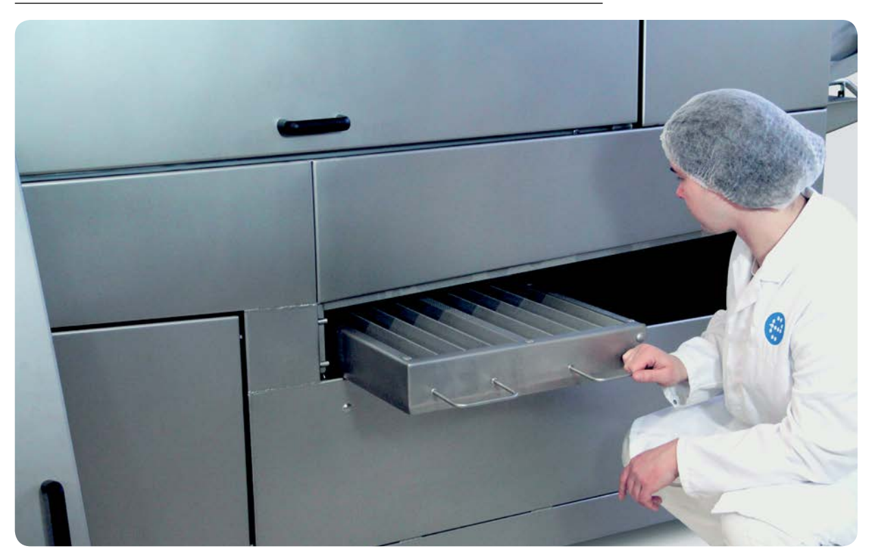
The EKW-6000, the filter tray is easy to take out.