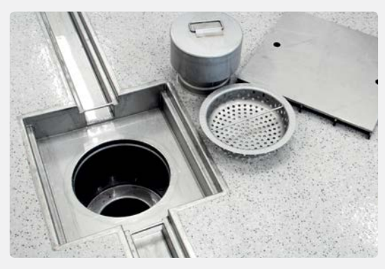
Drainage Elpress drains and gutters are of excellent and proven quality.