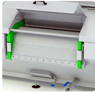
Rotating wedge-wire filter