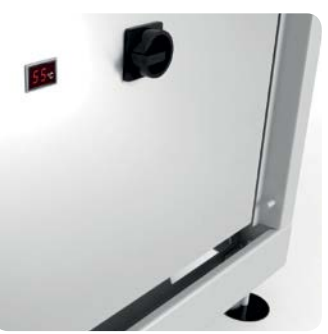
Digital temperature display