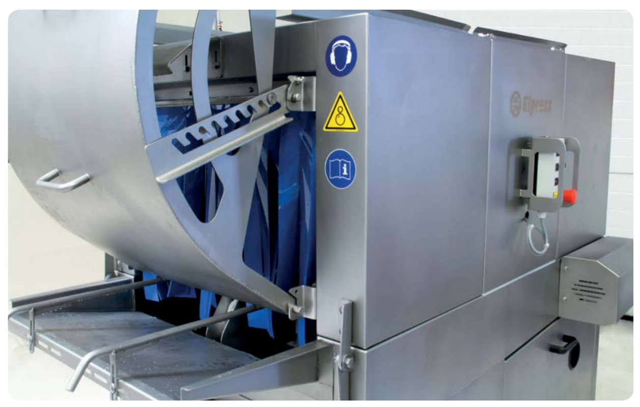
The EKW-1500, with optional one-person operation.